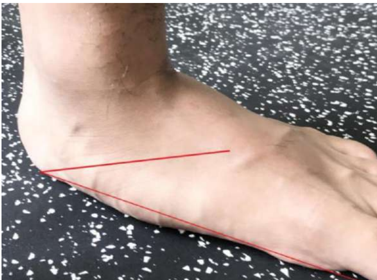
Figure 2. Severe overpronation of left foot