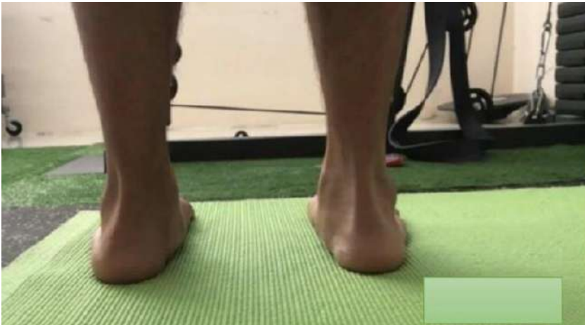
Figure 1. Examination of hindfoot alignment from behind; hindfoot aligned in a valgus position, particularly on the left foot

The patient was examined both weight bearing and non-weight bearing. On observation in a seated position, reduced medial longitudinal arch were seen on both feet. In a standing position, the patient was evaluated from behind for hindfoot alignment; as displayed in Figure 1 , the hindfoot was aligned in a valgus position, particularly on the left foot, and overpronation were apparent in both ankles. In order to differentiate between flexible or rigid flat foot, the patient was asked to stand on tiptoes; on both feet, the normal contour of the medial longitudinal arch was restored and the hindfoot moved into a varus position, indicating flexible flat feet.