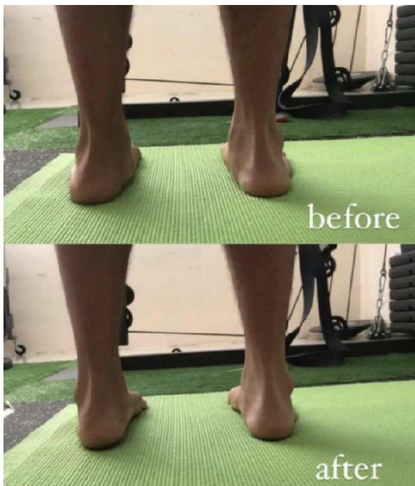
Figure 3. Evaluation of ankle and hindfoot alignment from behind in a standing position; reduced overpronation of the ankles and improved heel alignment can be seen after undergoing physiotherapy

On the other hand, Staheli's Arch Index represents the ratio of the central region width of the footprint (A) to the width of the heel region of the